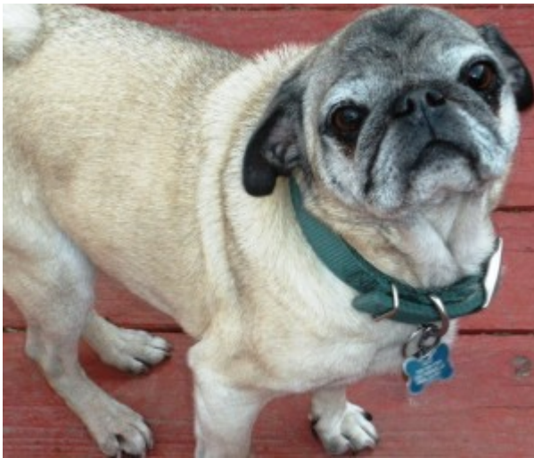
Max, a former Pug Pals rescue

As the summer moves from warm to hot, many pug owners consider shaving their pugs to make their dogs more comfortable. Researching this issue and talking with experts makes one thing very clear: Opinions are divided, with half advocating shaving pugs in the summer, and the other half advising against it. As a pug parent, the best you can do is make a good, well-reasoned and well-researched decision. Consult a trusted veterinarian or groomer to get their input on the subject. Ultimately, though, the decision is yours. Trust yourself to make the right decision for your adorable pug!