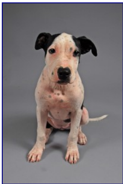
Dog with sunburn (we couldn't find a picture of a pug with sunburn)