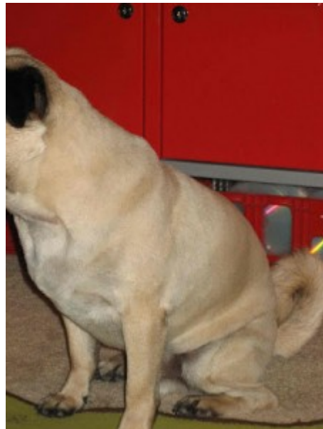
Some random shaved pug